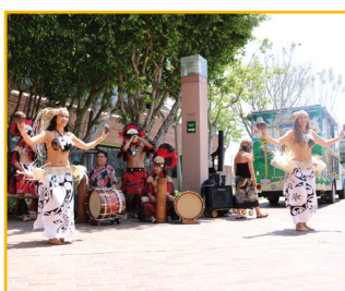
Student Affairs Celebrates Asian Pacific Heritage Month