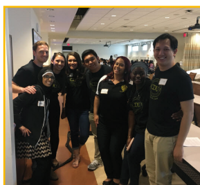
PA Program Hosts Pre-PA Conference