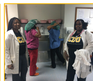
CDU Students Travel and Volunteer in Angola