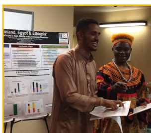
MS-BMS Students Present at Diplomats on Global Health Disparities Series