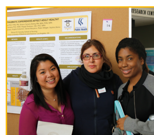
MMDSON Reception and Poster Presentation