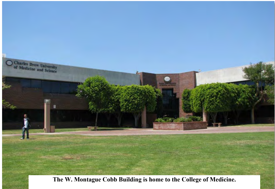
The W. Montague Cobb Building is home to the College of Medicine.