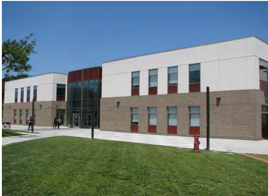
The Life Sciences, Research, and Nursing Education Building, home to the Mervyn M. Dymally School of Nursing.

5 Based on 2000 data, following Caucasians, Asian Americans constitute the second largest ethnic group of RNs working in California, at 11 percent of the workforce, followed by 4 percent African American and 3.6 percent Hispanic.