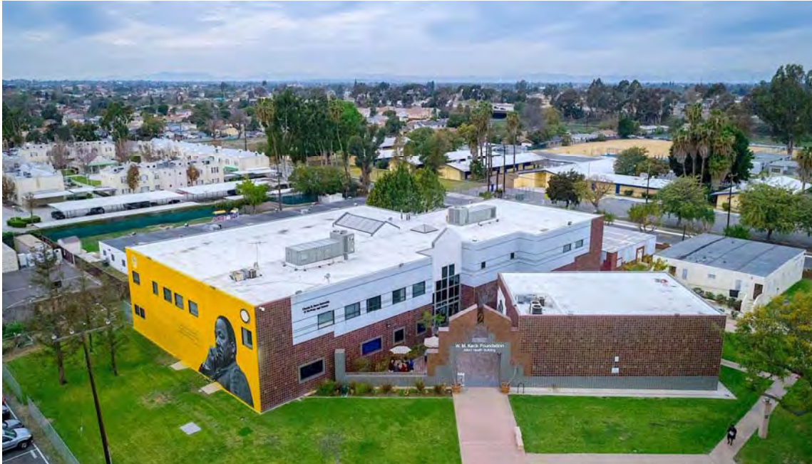
The W. M. Keck Foundation Building, home to the College of Science and Health.