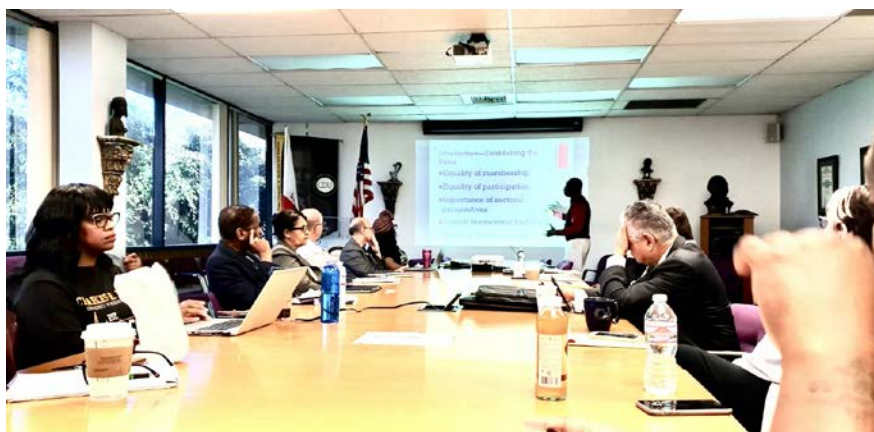
Strategic Planning Training Session